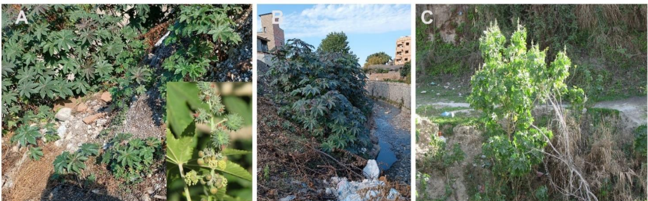
Fig. 3. The escaped castor bean ( Ricinus communis ) in Gorgan riverbanks (A & B: Photo by S. Sohrabi) and Faryab waterfall (C: Photo by A.H. Pahlevani).