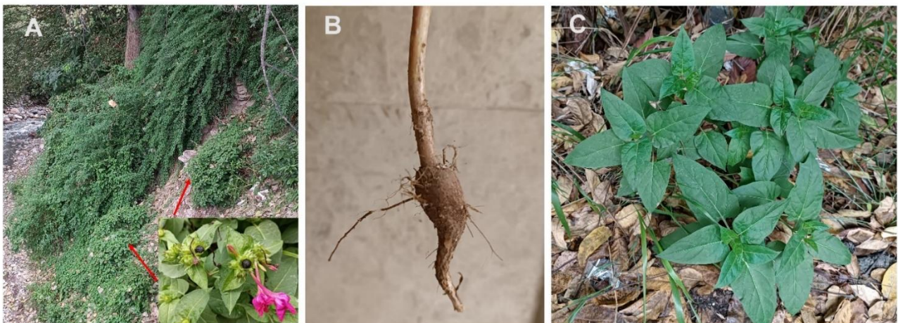
Fig. 2. The growth of the Mirabilis jalapa in Gorgan riverbanks: A. Invaded habitat with flowering and fruiting shoots, B. Tuberous root, C. Seedlings & young plants (Photo by S. Sohrabi).