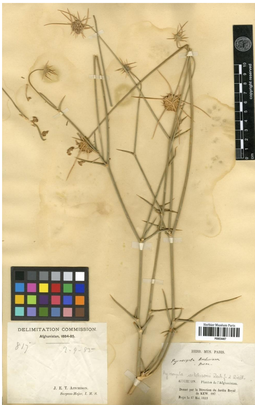
Fig. 10. Isotype of Pyncocyclus spinosa var. aitchisonii (Aitchison 817, P00834407).