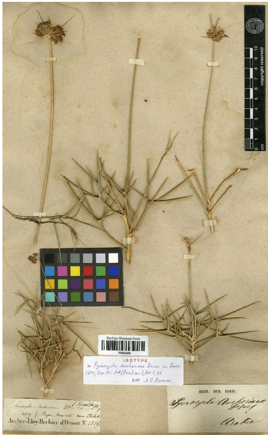
Fig. 6. Pyncocykla aucheriana var. aucheriana (Aucher-Eloy 4559, P00834394).