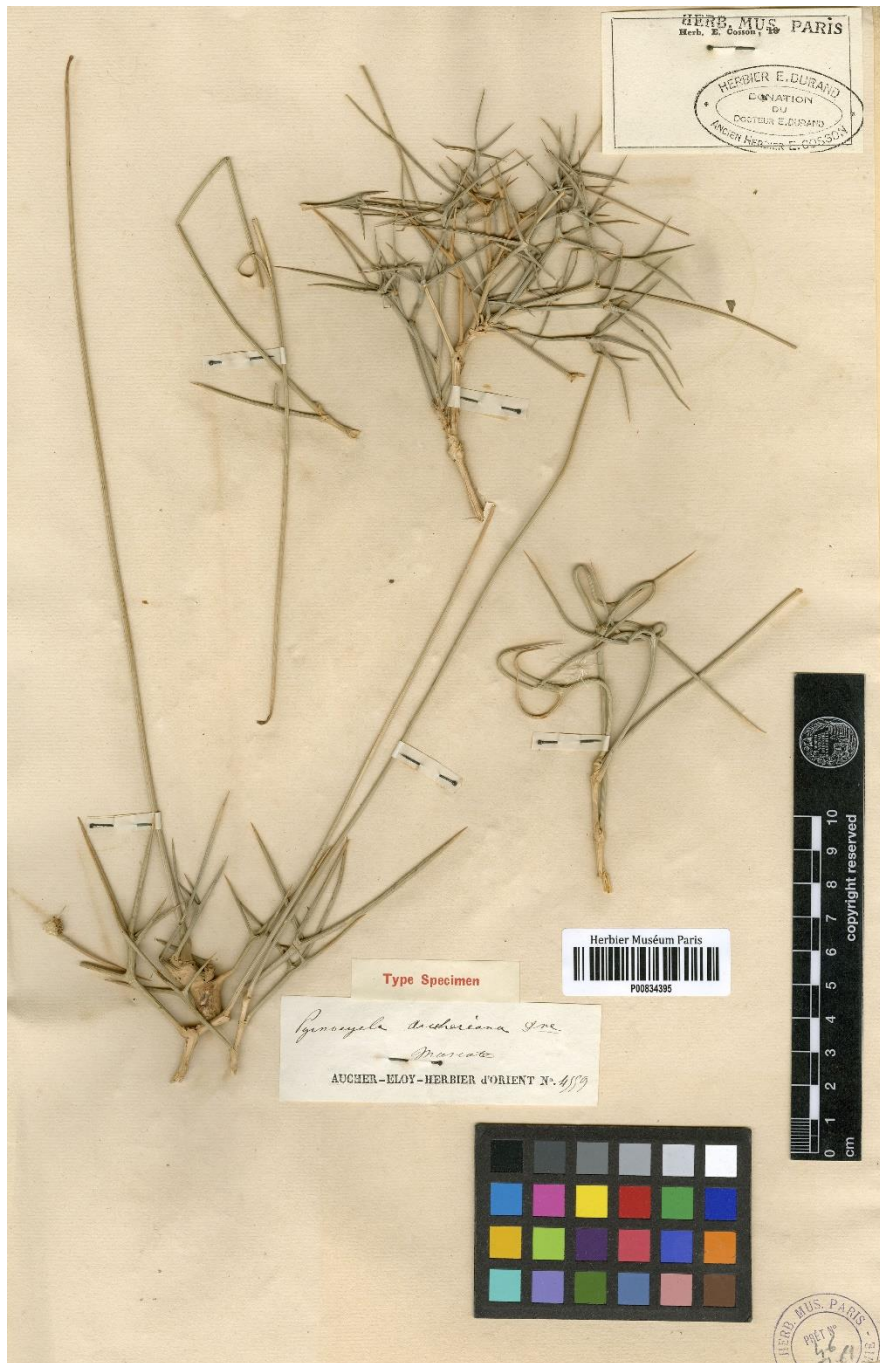
Fig. 7. Pyncocyclus aucheriana var. aucheriana (Aucher-Eloy 4559, P00834395).