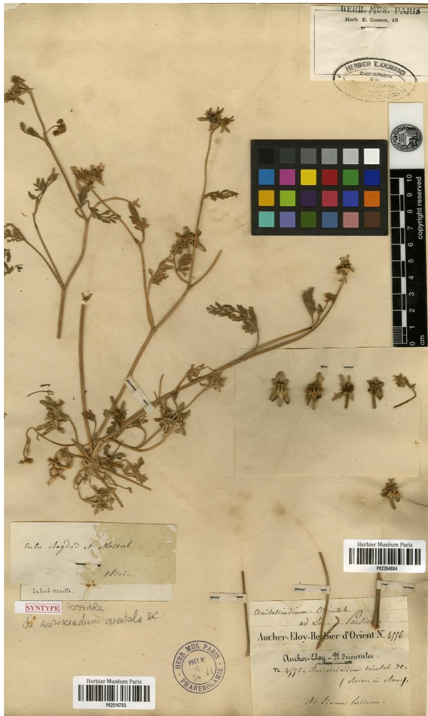
Fig. 2. Anisosciadium orientale (Olivier & Bruguère s.n., P02516703).