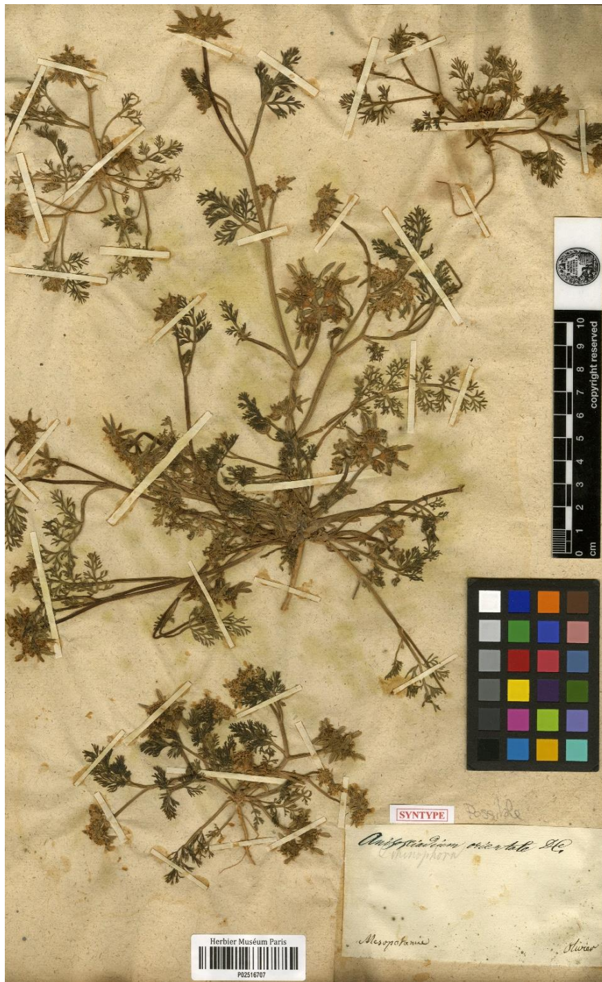
Fig. 3. Anisosciadium orientale (Olivier & Bruguère s.n., P02516707).