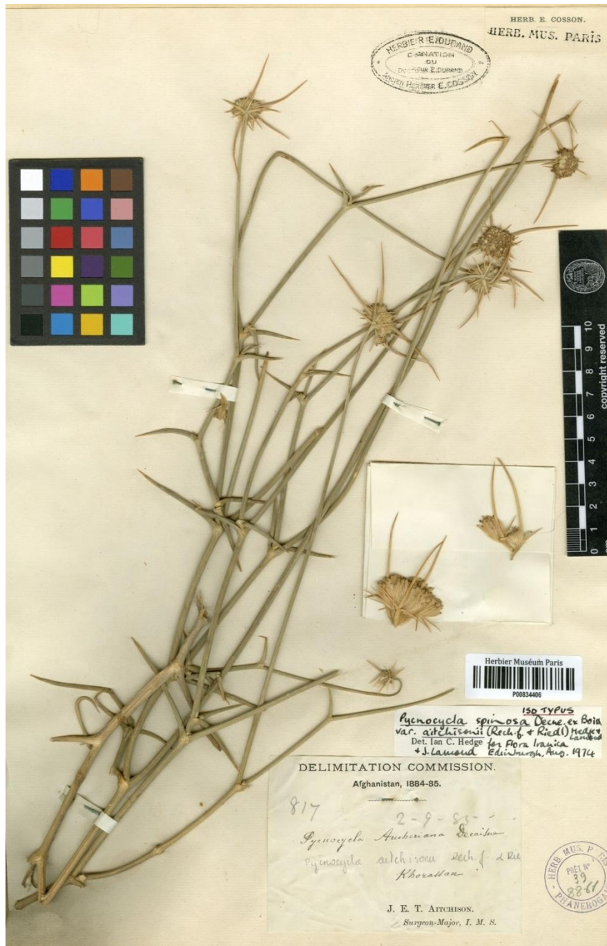
Fig. 9. Isotype of Pycnocycla spinosa var. aitchisonii (Aitchison 817, P00834406).