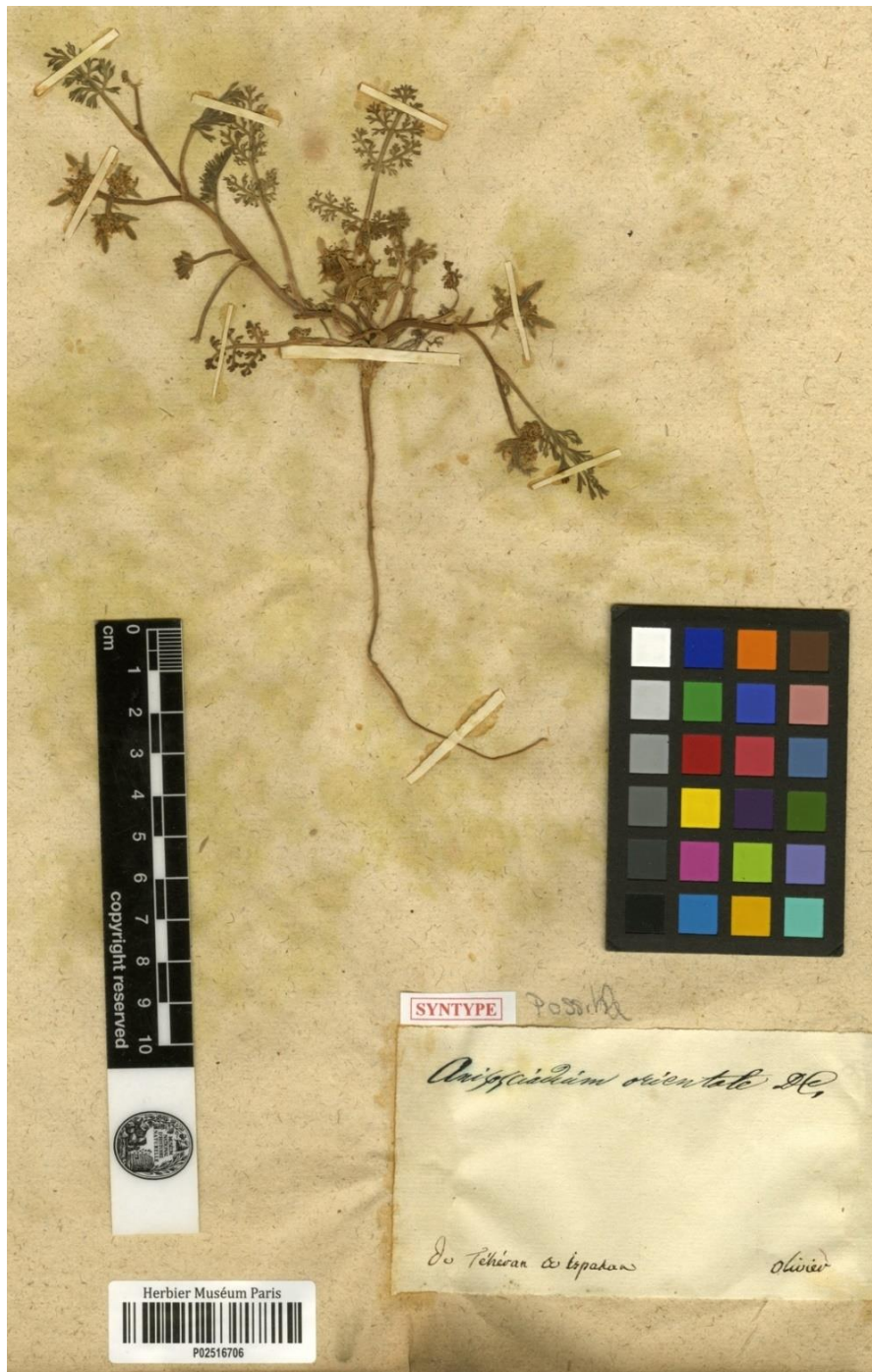
Fig. 1. Anisosciadium orientale (Olivier & Bruguère s.n., P02516706).