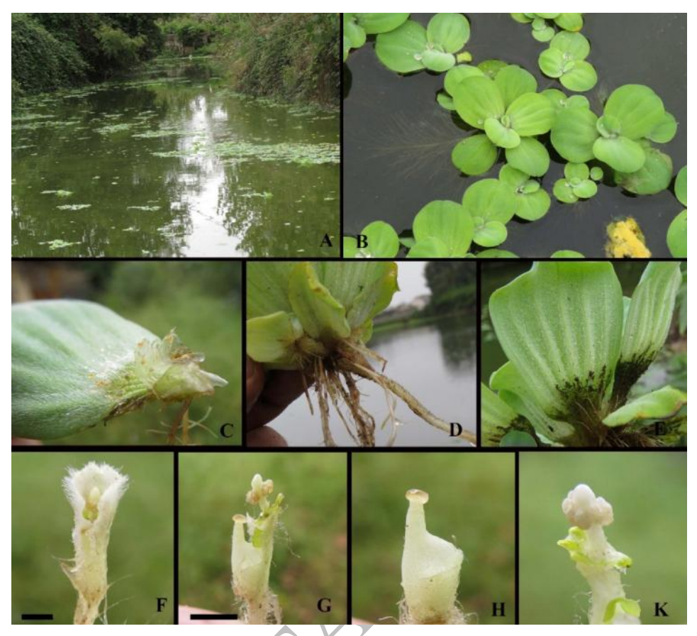
Fig. 2. Pistia stratiotes : A. Habitat, B. Plants, C. Ligule, D. Stolon, E. Leaf in adaxial side, F. Spathe, G. Spadix (male and female flowers along with their position), H. Female flower, K. Male flowers (Bar = 4 mm).