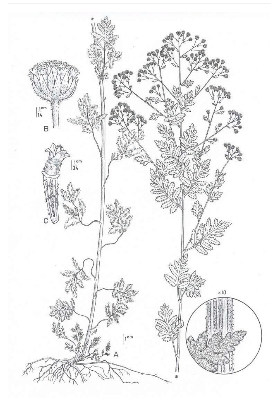
Fig. 3. Tanacetum vulgare: A. Habit, B. Involucre, C. Tubular floret with achene.