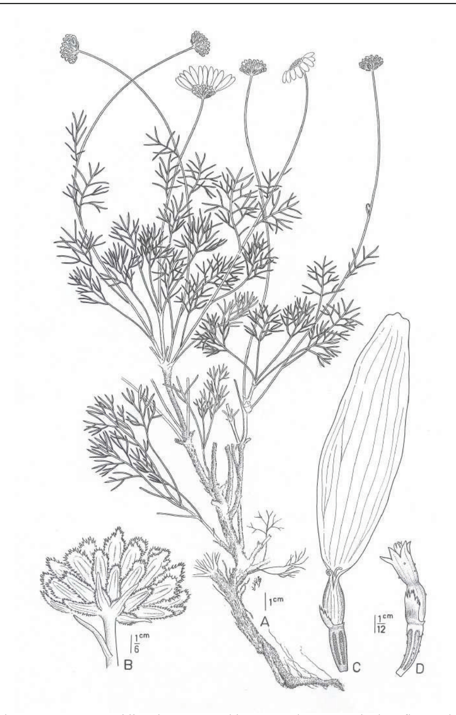
Fig. 4. Tanacetum zahlbruckneri : A. Habit, B. Involucre, C. Ligulate floret with achene, D. tubular floret with achene.