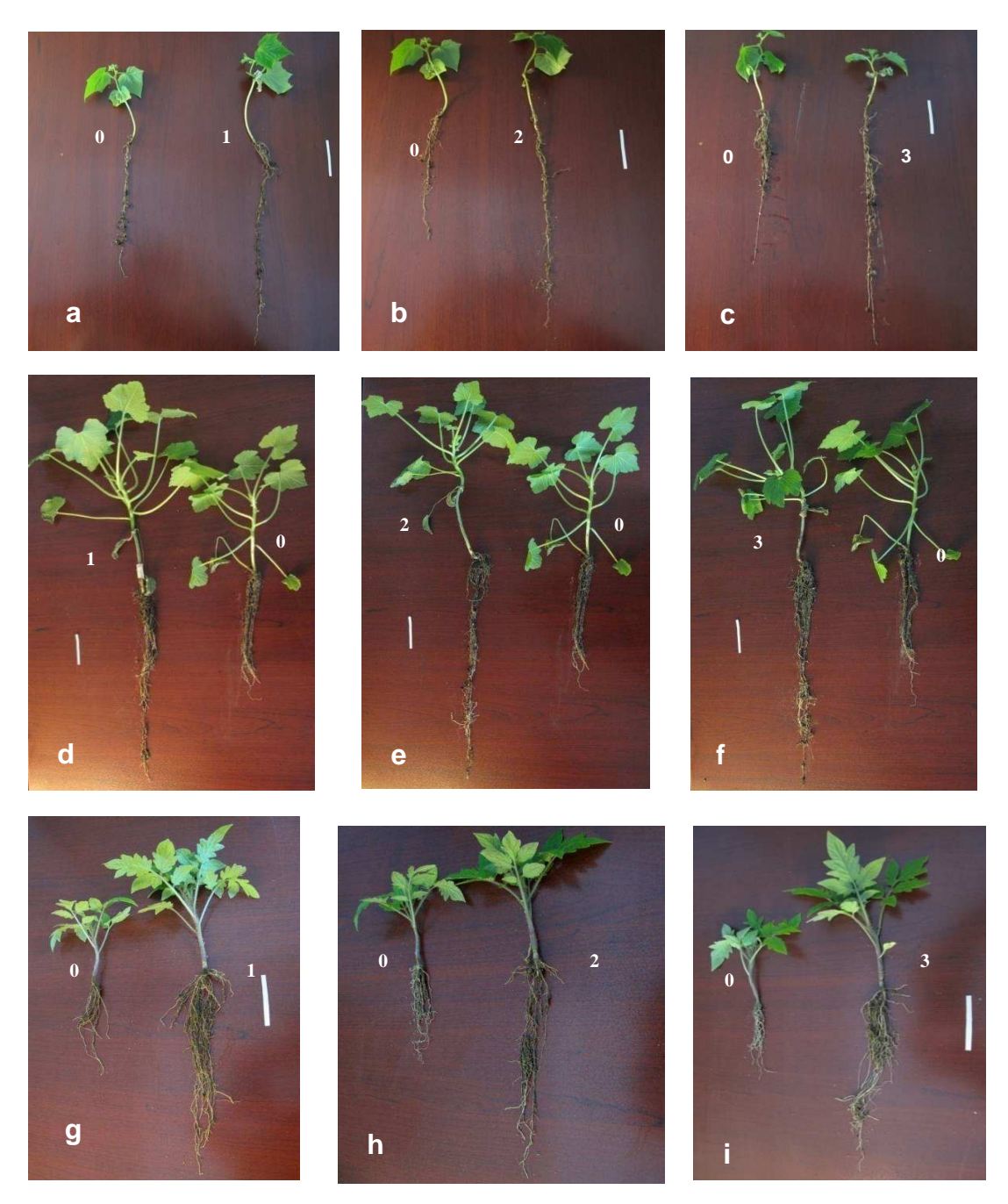
Fig. 2. Plant height and root length of control and treated plants: a-c. Cucumber seedling, d-f. Squash seedling, g-i. Tomato seedling (0. Control, 1. Plant treated by Anabaena , 2. Plant treated by Nostoc , 3. Plant treated by Nodularia (Bar = 5 cm).