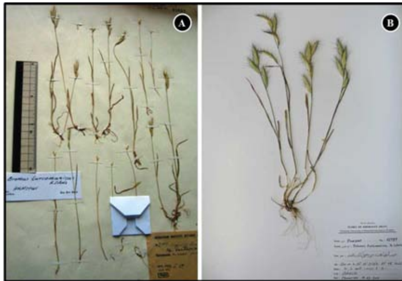
Fig. 2. Herbarium specimens of Bromus turcomanicus : A. Holotypus (2304 W), B. 42989 FUMH.