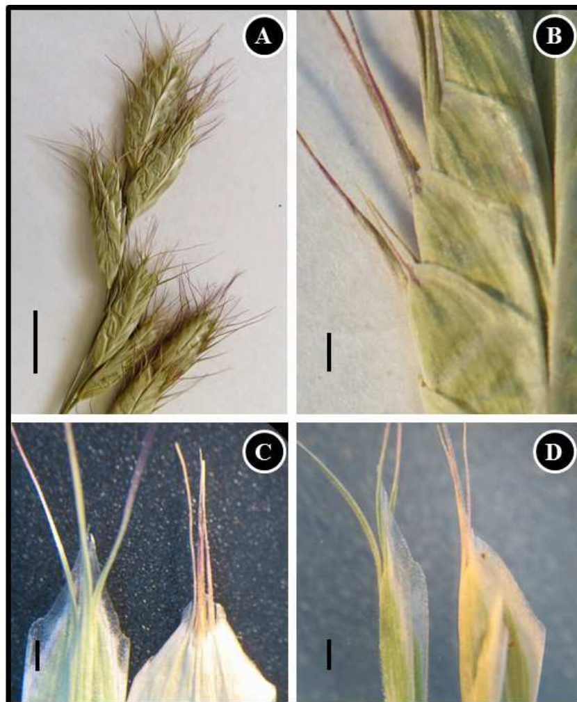
Fig. 3. A & B. Bromus turcomanicus (40679 FUMH) spikelets (Bar: A = 10 mm) and their three-awned lemmas with short and blunt apex (Bar: B = 1 mm), C & D. Comparison of the lemma apex and insertion point of central awn in B. danthoniae (left) and B. turcomanicus (right) (Bars = 1 mm).